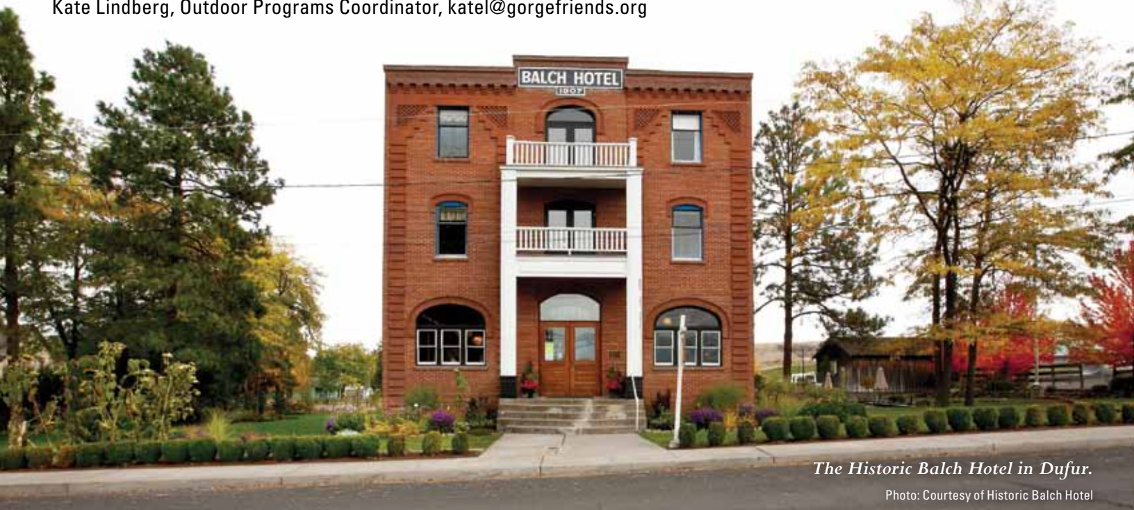
The Historic Balch Hotel in Dufur.