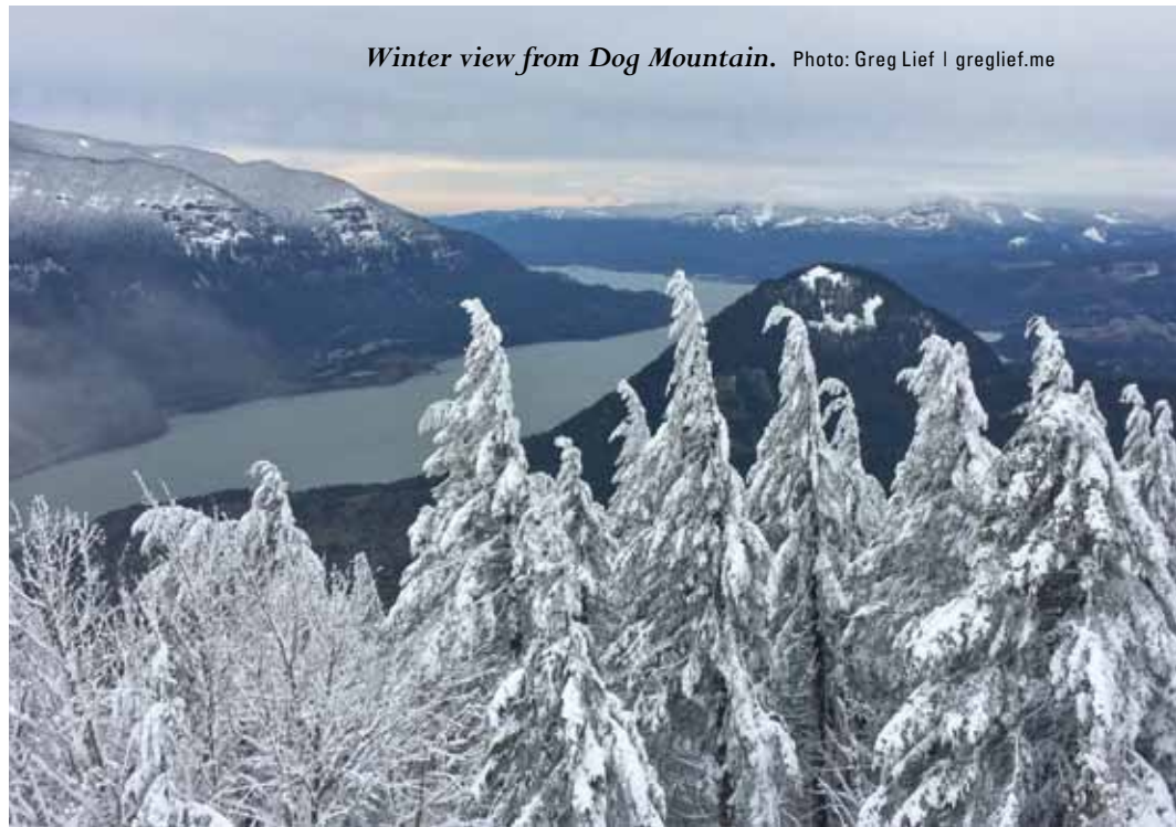
Winter view from Dog Mountain.