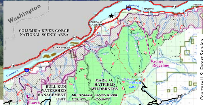
New Gorge wilderness areas are outlined in purple.

Friends celebrates President Obama's recent signing of the Omnibus Public Lands Act. This Act creates 26,000 acres of new wilderness in the Columbia Gorge, including ancient forests on Larch Mountain, the landscapes around Eagle Creek Canyon, and the spectacular ridgeline above Cascade Locks.