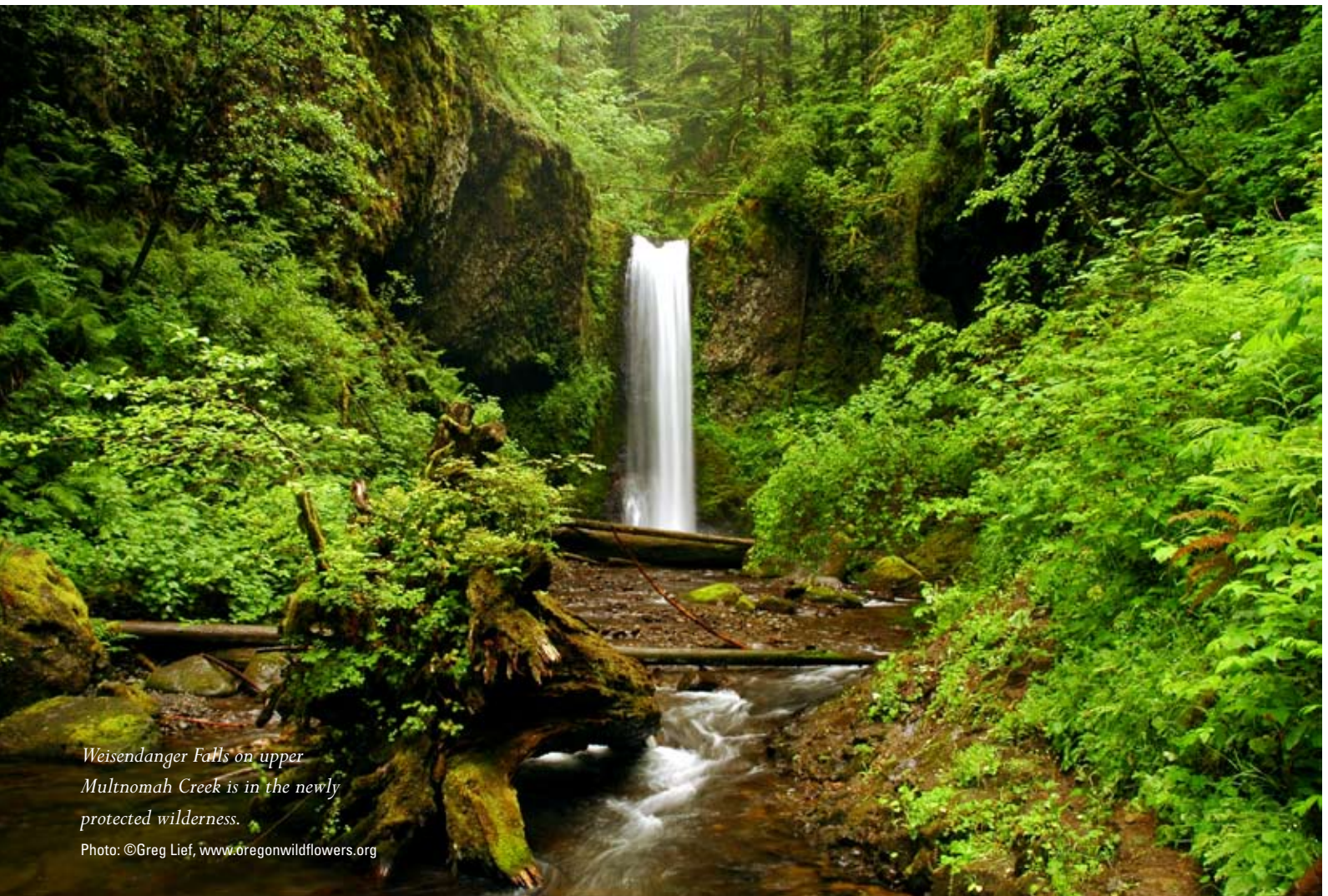
Weisendanger Falls on upper Multnomah Creek is in the newly protected wilderness.

Friends of the Columbia Gorge and Oregon Wild struck a compromise with mountain bike advocates to exclude the Larch Mountain loop trail from the Wilderness bill. That trail is open to mountain bikes but would have been closed to bikes if designated as Wilderness. This