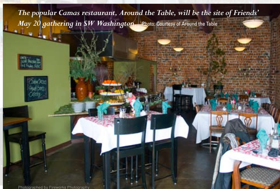
The popular Camas restaurant, Around the Table, will be the site of Friends' May 20 gathering in SW Washington

Invitations have been sent to all our members and supporters in southwest Washington. For more details, call 503-241-3762 x102.