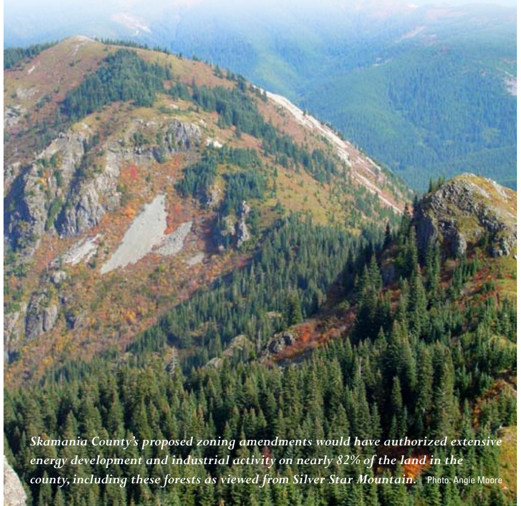
Skamania County's proposed zoning amendments would have authorized extensive energy development and industrial activity on nearly 82% of the land in the county, including these forests as viewed from Silver Star Mountain.

For additional information on this project, visit www.efsec.wa.gov ; click the "Whistling Ridge" link in the right column.