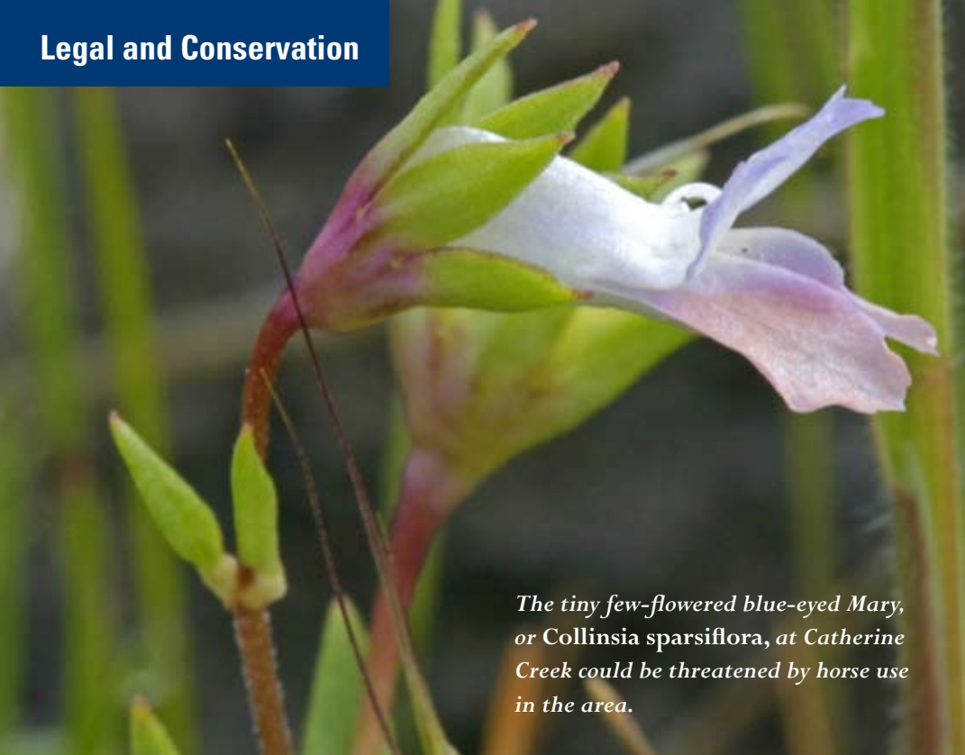
The tiny few-flowered blue-eyed Mary, or Collinsia sparsiflora, at Catherine Creek could be threatened by horse use in the area.