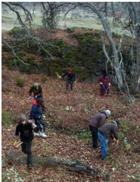
Volunteers from Columbia Gorge Community College help with stewardship at Friends' Dancing Rock property.