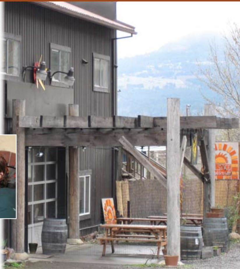
Solstice Wood Fire Café in Bingen is a popular community gathering place.