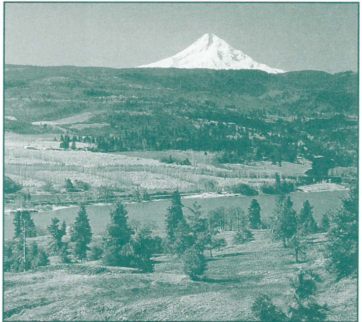
Orchards and open spaces east of Hood River are protected through the National Scenic Area.

The Gorge needs our stewardship to ensure it will be there in all its magnificence for our children and grand-