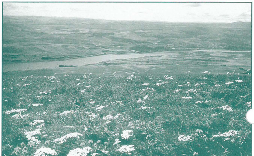
Spring brings fields of wildflowers to the eastern Gorge.